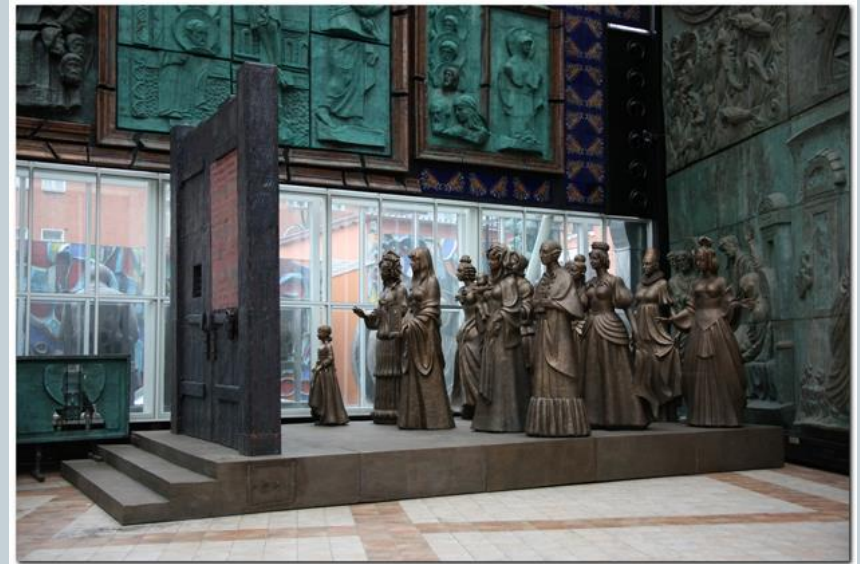
Decembrist Women: The Gates of Fate